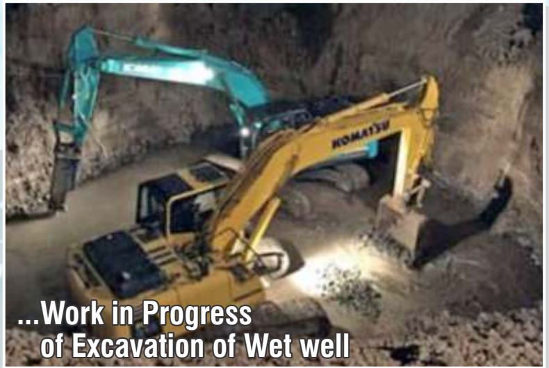
...Work in Progress of Excavation of Wet well